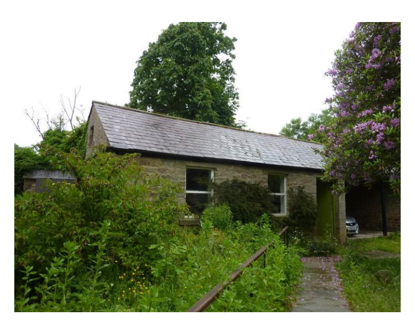
Figure 4. The coach house and stables