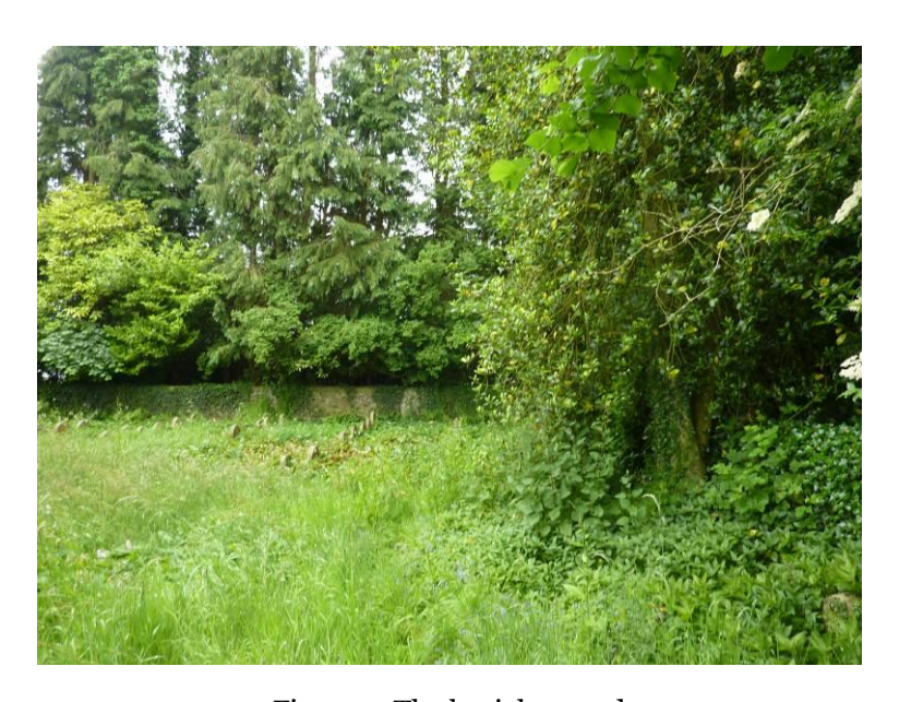
Figure 3. The burial ground

A burial ground on the north and west sides of the meeting house is walled. Headstones of simple form remain in situ and the area is managed as a wildlife garden. The burial ground was extended at unknown exact date, probably in the late nineteenth or early twentieth century. Burial records are kept on site and record interments between 1830 and 2015.